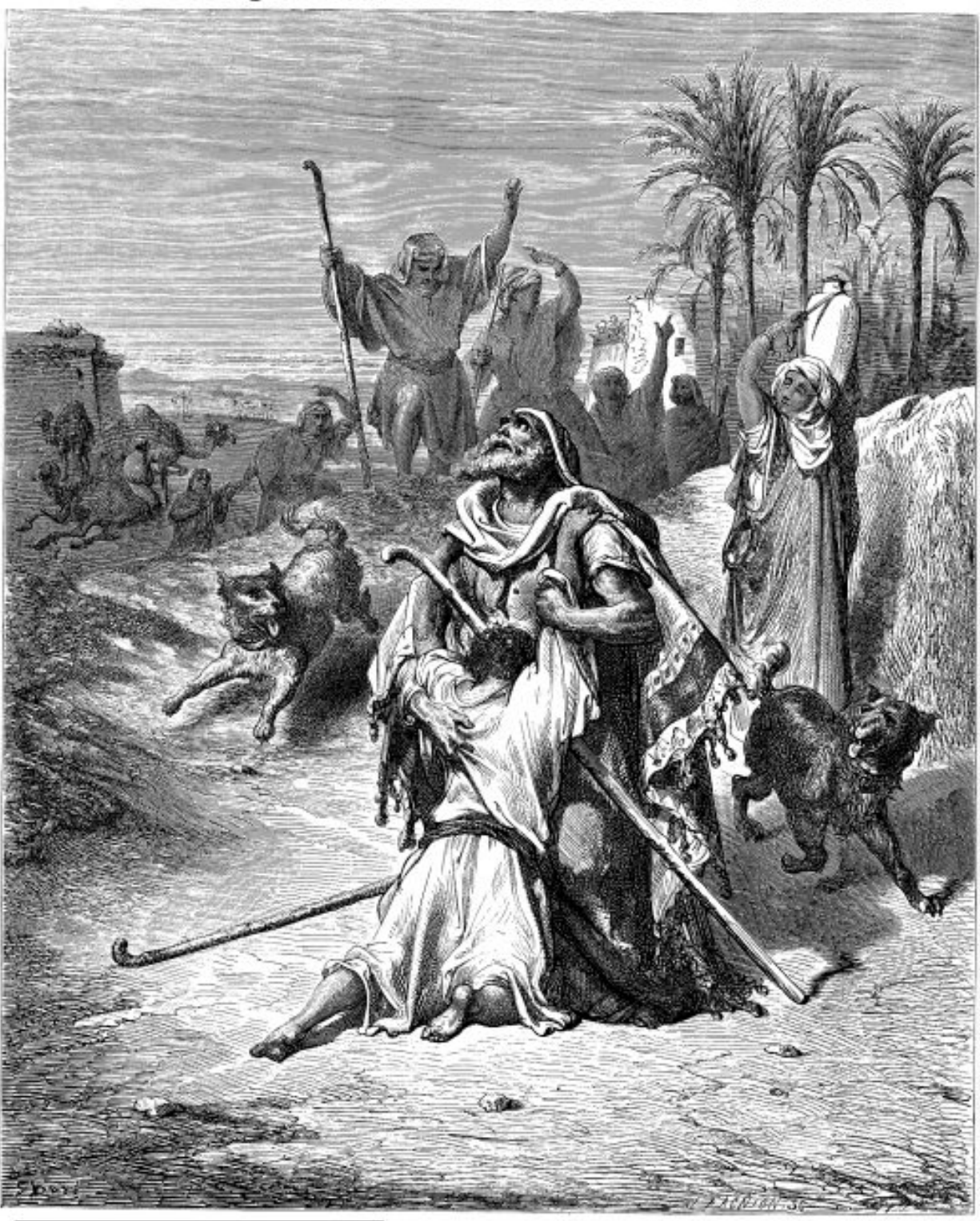
"The Prodigal Son in the Arms of His Father" by Gustave Doré

Doré Bible Illustrations • Free to Copy www.creationism.org/images/